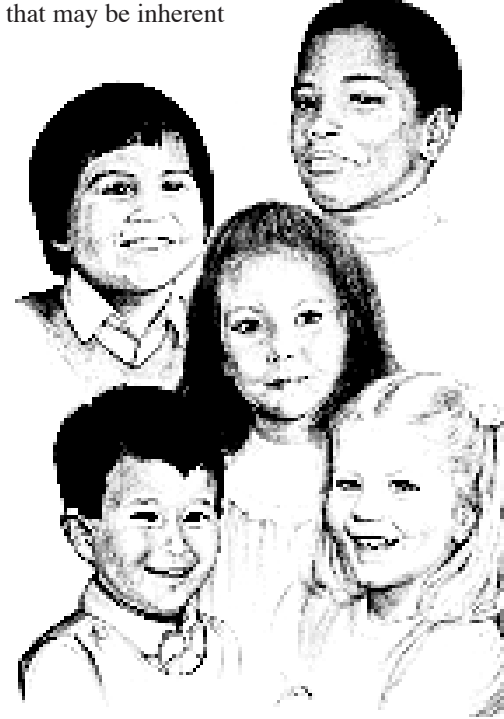
Drawing courtesy of the Iowa Department of Education

collecting and analyzing data that will be used for instructional planning as opposed to simply collecting data to justify a label" (p. 69).